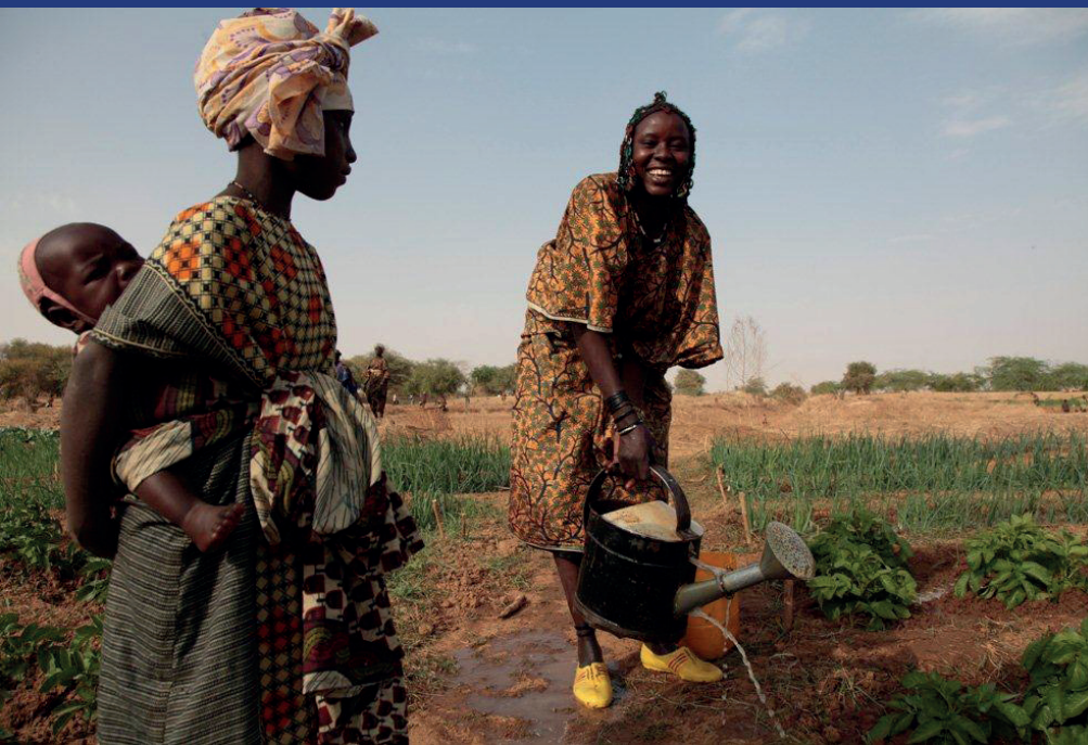
► Irrigated market garden cultivated by Malian women.